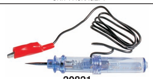
20821 24 & 48 Volt Circuit Tester

Outstanding performance for testing (with power on) battery systems of heavy duty vehicles, trailers, aircraft, boats, farm and construction equipment up to 48 volts.