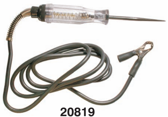
Heavy Duty Circuit Tester

An excellent quality electrical circuit tester for checking 6 and 12 volt systems. It's made to last! Has a heavy duty battery clip. 5 feet of tough, flexible, heavily insulated rubber coated wire is retained in a spring supported strain-relief design that withstands the most rugged use. Bulb #1889 (Auveco #18003) is easily replaced.